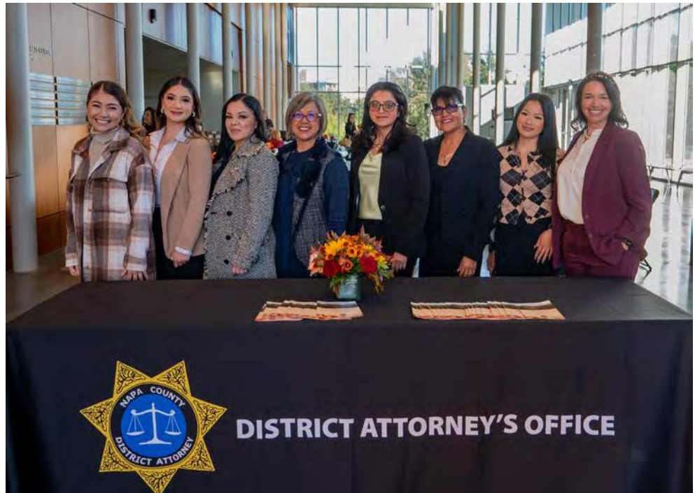
The DA Office's Victim Services team played a vital role in the planning and execution of the 4th Annual Survivors' Breakfast.