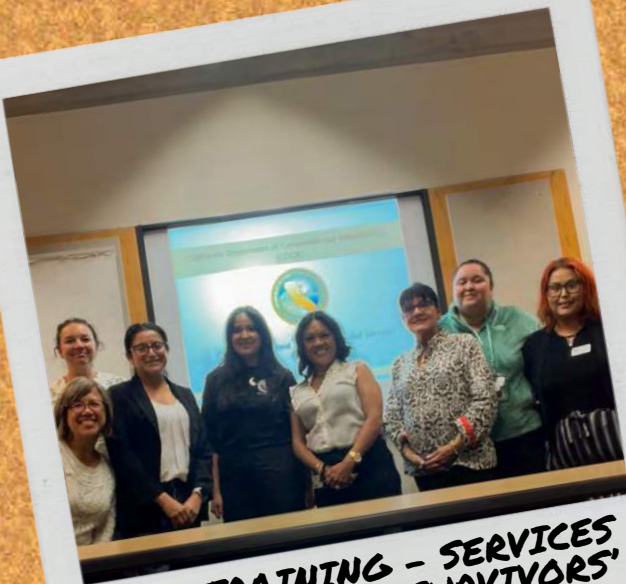
CDCR TRAINING - SERVICES FOR VICTIMS + SURVIVORS' RIGHTS - 9/20/2024