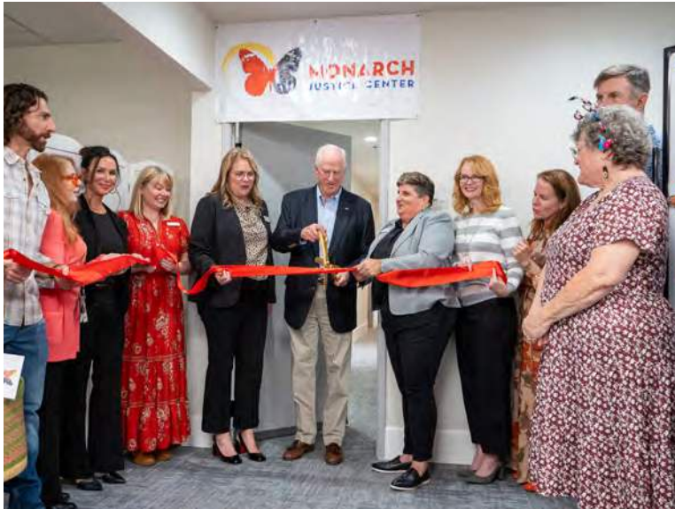
Congressman Mike Thompson (center) joins MJC Board Members for a ribbon cutting ceremony commemorating MJC's new location.

"The other thing we gained is that one of the rooms here is a forensic exam room that SANE-