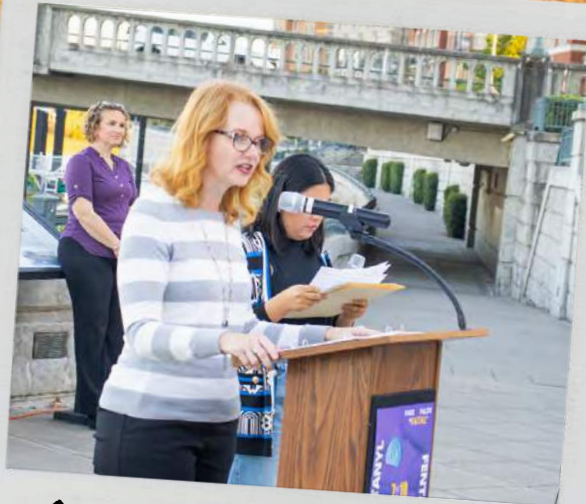
OPIOID AWARENESS RALLY + CANDLELIGHT VIGIL 10/23/2024