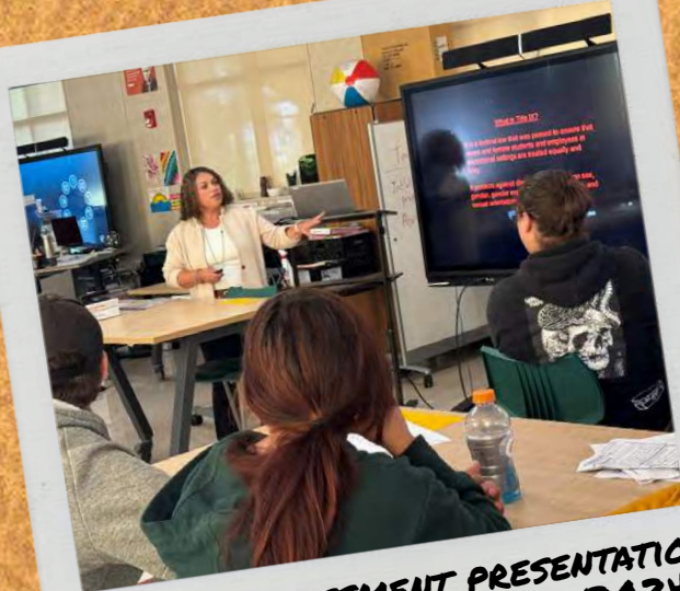
SEXUAL HARASSMENT PRESENTATION @ CAMILLE CREEK - 10/3/2024