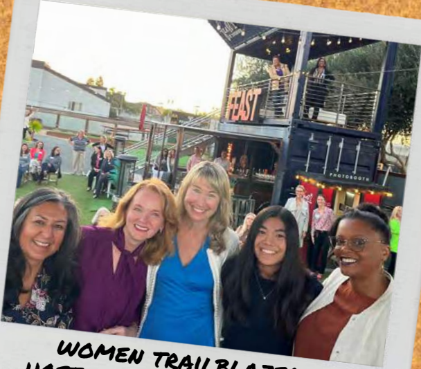
WOMEN TRAILBLAZERS HOSTED BY MERRILL LYNCH 10/17/2024