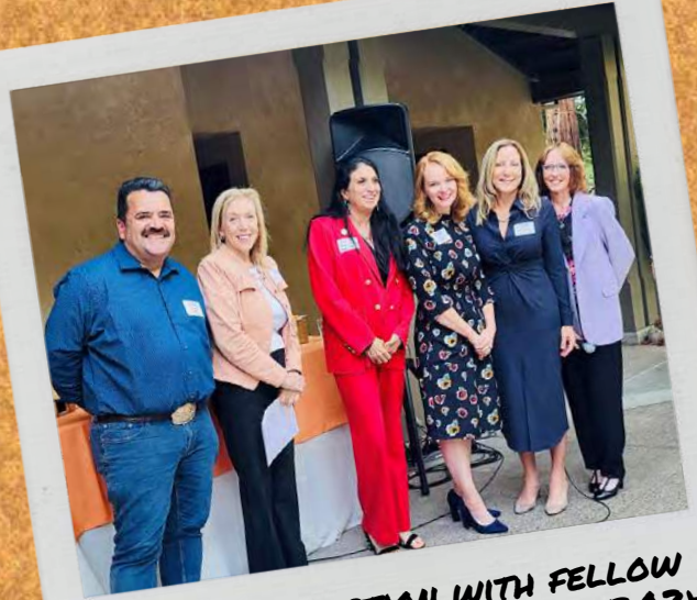
PROP 36 RECEPTION WITH FELLOW DAS + NAPA SHERIFF - 10/20/2024