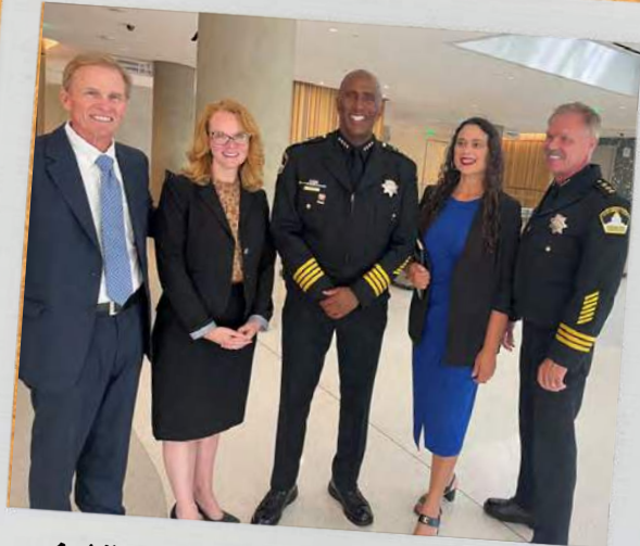
A VISIT TO THE STATE CAPITOL 9/10/2024