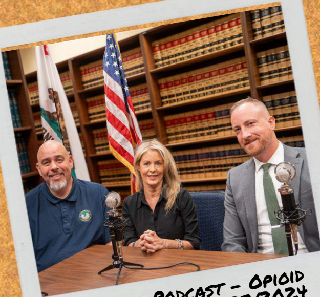
SIDEBAR PODCAST - OPIOID AWARENESS - 10/23/2024