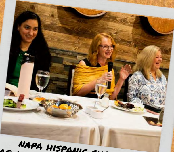
NAPA HISPANIC CHAMBER OF COMMERCE'S LATINO LEADERS ROUND TABLE - 9/20/2024